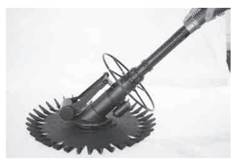
Step 12 Re-connect cleaner suction hose and your Swimkleen Pool Cleaner is ready to go back to work keeping your pool clear of debris.