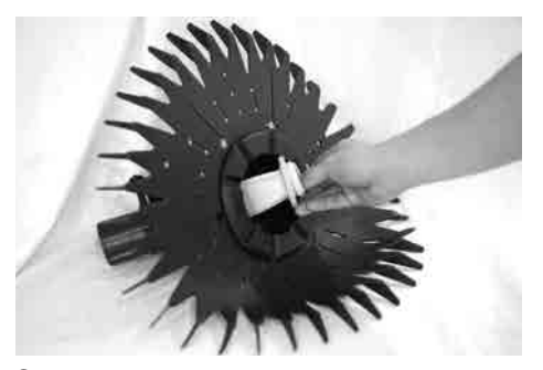
Step 4 Remove diaphragm from Swimkleen body.