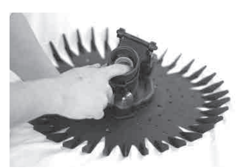
Step 9 Once diaphragm is correctly positioned push out folded end to fully open diaphragm tube.