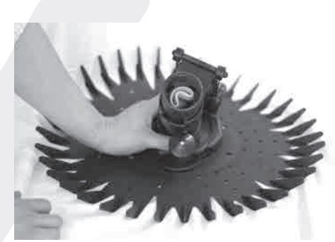
Step 8 Ensure the top end of diaphragm is correctly positioned in top end of cleaner.