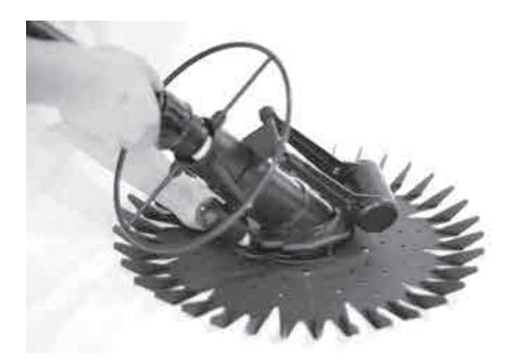
Step 11 Re-install deflector ring onto cleaner body, outer extension housing & nut, tightening nut clockwise.