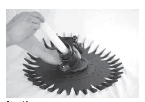
Step 10 Insert inner tube and ensure correct engagement with diaphragm.