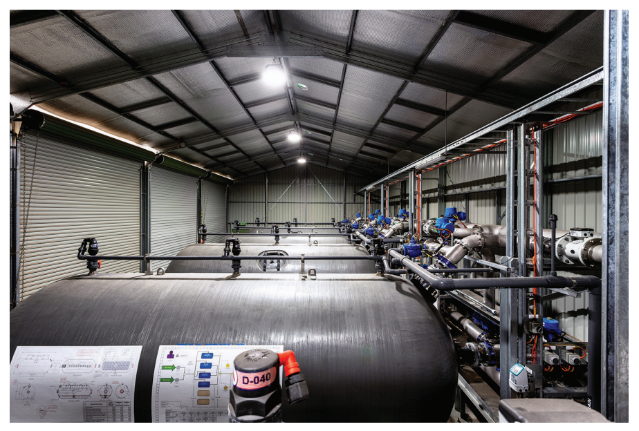
To deliver high-quality filtered drinking water free from unwanted taste and odours, Filtec installed Waterco's MPD10,000 Commercial Fibreglass Nozzle Plate Media Filter.

• Durability: Fibreglass vessels have a mechanical and chemical resistance superior to steel, plus fibreglass does not rust or corrode and is able to withstand damage from many types of water treatment chemicals. Additionally, they do not leave any unsightly stains