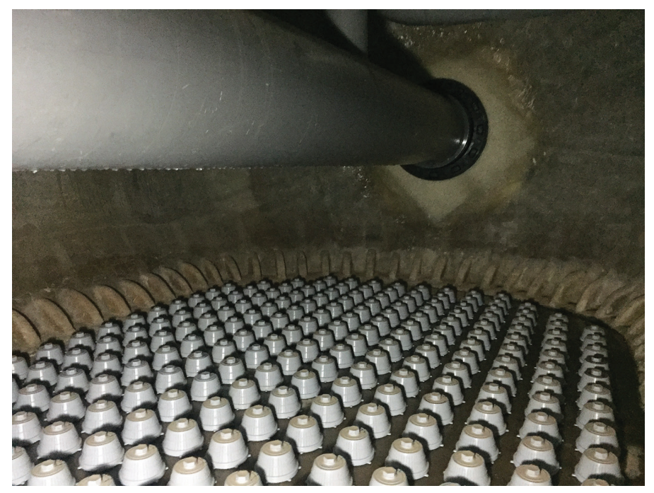
Nozzle plate filters are fitted with a plate and nozzle system, which ensures uniform flow for both filtering and backwashing. This provides maximum performance through the media bed.

• Easy to maintain: Once installed they are virtually free of maintenance or repairs. This compares with steel vessels, which require the anticorrosive coating to be maintained periodically, with certified welders required to make repairs to the lining with epoxy coating