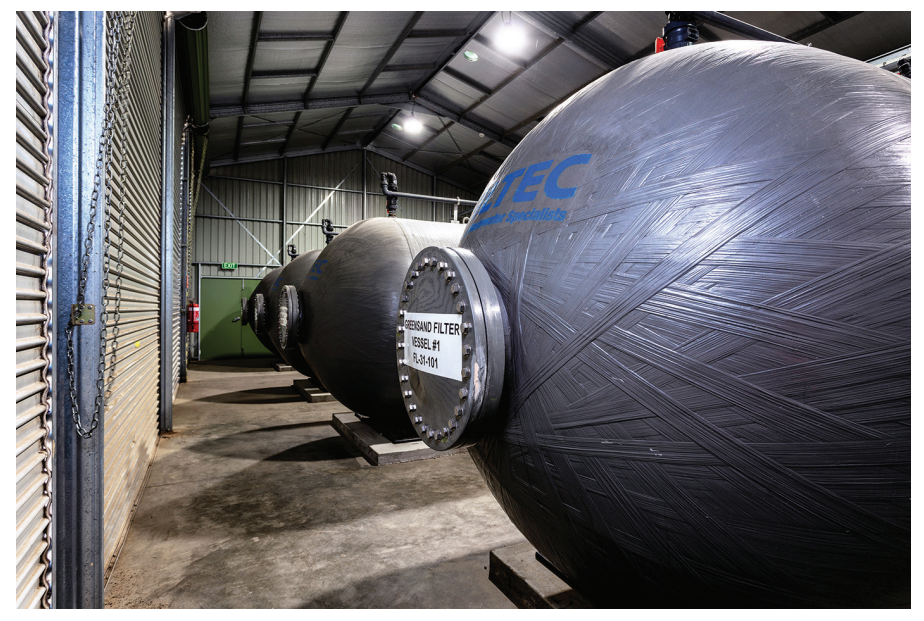
Fibreglass vessels have a mechanical and chemical resistance superior to steel, plus fibreglass does not rust or corrode and is able to withstand damage from many types of water treatment chemicals.