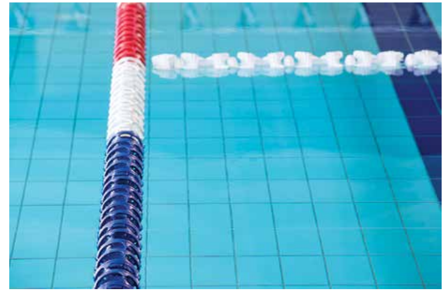
With the pool currently operating at .8-.85 free chlorine and almost zero chlorine combined – at 32 degrees – there is virtually no chlorine or chemical odours. A positive feedback from the teaching staff, they haven't had any eye or ear irritations despite being in the water for 3-4 hours.

into the backwash," he says. "We've got Waterco Nozzle Plate Filters on another council complex with three pools - which does get a hammering - and they have been producing really good water quality for around three years."