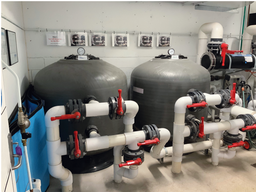
Micron vertical commercial filters are equipped with "Fish tail" hydraulically balanced laterals, to improve its filtration and backwashing hydraulic efficiency.