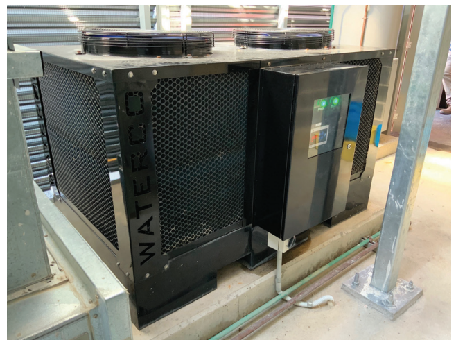
The new generation cost effective Electroheat PRO heat pump is the latest advancement in commercial size swimming pool heating. ▶

Designed to heat up to 250,000 litres, Waterco's Electroheat PRO is the latest advancement in commercial size swimming pool heating. It delivers efficient cost-effective pool heating in an easy-to-operate and install package.