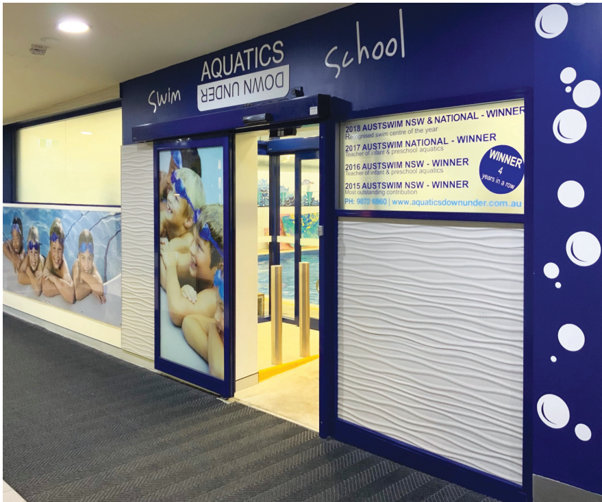
In 2018, Aquatics Down Under received the prestigious NSW and National Swim centre of the year award.

In 2018, Aquatics Down Under received the prestigious NSW and National Swim centre of the year award to acknowledge its passionate teachers, innovative programs and dedication to catering to students with special needs.