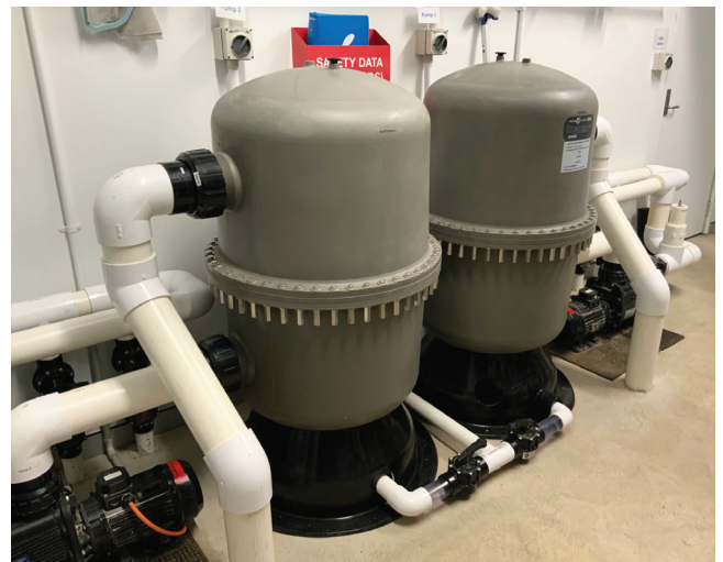
MultiCyclone 70XL is a brilliant pre-filtration device that works on the basis of centrifugal water filtration and is designed with no moving parts and no filter media to clean or replace.

Waterco's multi-award-winning product and the only centrifugal filter built for commercial installations. MultiCyclone 70XL pre-filters up to 80 per cent of the incoming dirt load prior to it reaching the main filter. This increases the filter media's lifespan whilst reducing backwash frequency and water use.