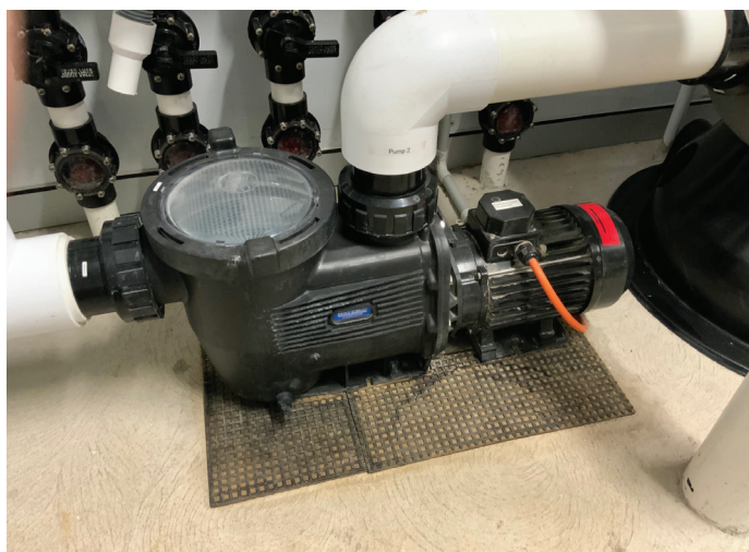
The Hydrostar pump has been designed to provide a substantially quieter operation with even higher flow rates and higher head than previous models.

Purpose-built for commercial pools, aquatic facilities and aquatic parks, Waterco's new Hydrostar pumps operate with lower noise levels and improved hydraulic efficiency. The pump body does not rust or corrode and is able to withstand damage from many types of water treatment chemicals. Waterco's commercial thermoplastic pumps weigh less than their steel counterparts without any sacrifice in strength and durability.