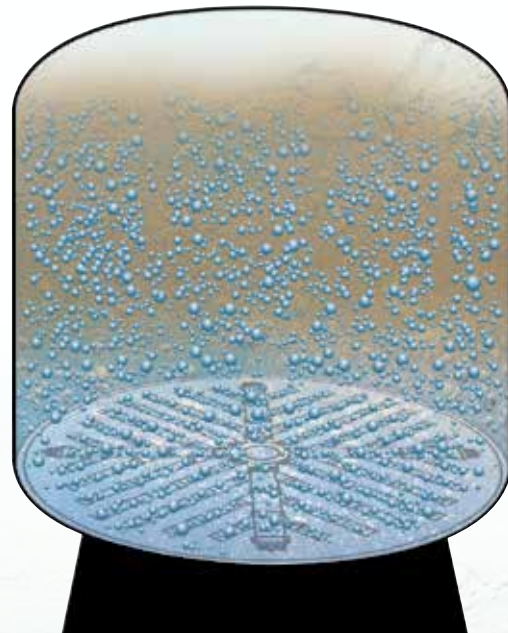
Fish Bone lateral system