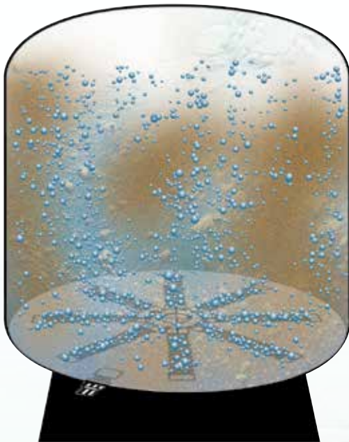
Conventional filter lateral system

Hydron Split-Tank Filters features Waterco’s “fish bones” lateral, which improves water flow distribution through the filter bed. Conventional laterals are not suitable for larger size commercial filters. Dead legs’ exist between the laterals, and the water flow is not optimised through the filter bed. Conversely, Waterco’s ‘fish bones’ lateral configuration eliminates any dead legs.